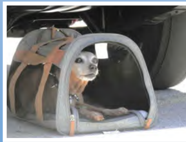
Resting in the shade of her "dad's" 1963 Super Stock 426 Plymouth is Hoochi- Mama Udell. That big 426 rests up front. She goes most everywhere with Rich.