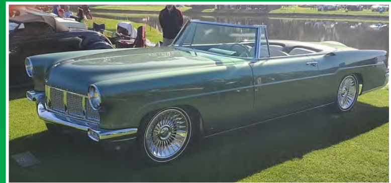
1956 Lincoln MK II by Chip Foos

Showing at The Amelia served to validate all the many hours I spent trying to fasten nuts to bolts or re-attaching wires that were "just" out of reach. There were days of trying to figure out the one of a hundred possible ways to fit a replacement part into the slot the factory managed to install it in, to begin with. Or how you attach a hose to a vent you can't see, much less get your fingers to? Then there's that little job of adjusting the four dual Weber carbs... Like the nominated actors on the award shows say, "I was just honored to be recognized among my peers."